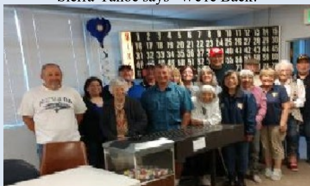
Sierra-Tahoe says "We're Back!"

Returning Bingo night since COVID for Br/Unit 137. Preceding Bingo was a BBQ Rib & Chicken dinner with all the trimmings.