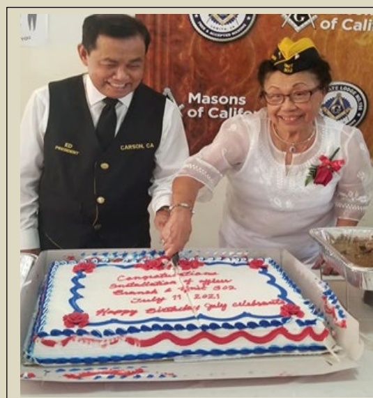
Unit 302 Carson Branch and Unit Presidents.

Installation was a great celebration, this was their first large group meeting since the mandates.