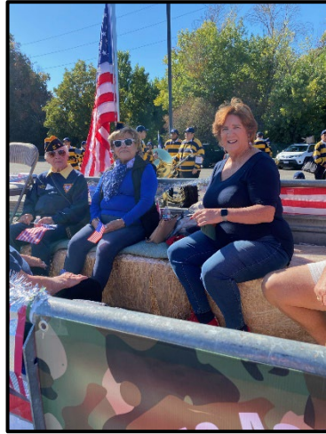
Members of Unit 287 at the Veterans Day parade in downtown San Jose, California.