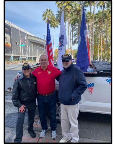
Members of Branch 287 at the Veterans Day parade in downtown San Jose, California.